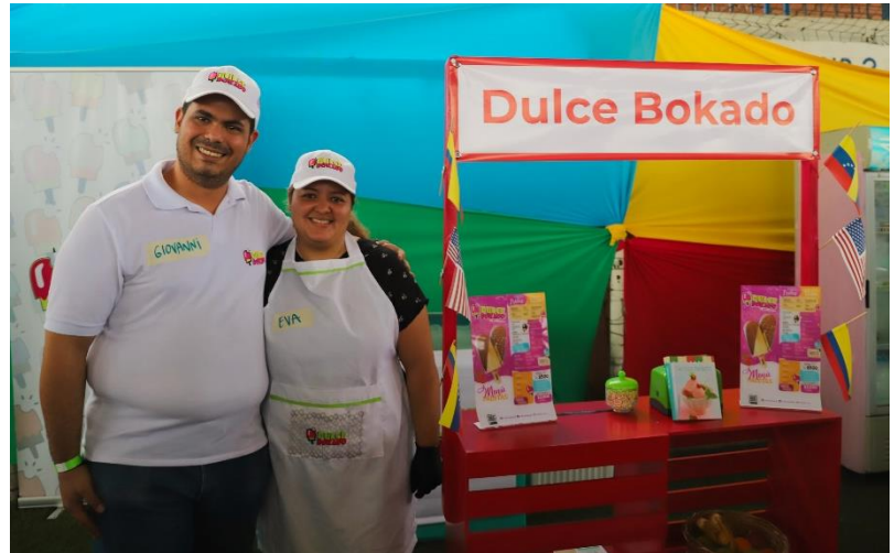
Presentation of economic units from Integrando Horizontes, organized by PRM and PADF in La Guajira.

During the month of February, more than 8,300 beneficiaries received assistance through 27 RMRP partners and implementers, in 16 municipalities from 10 departments, both in border departments and refugees and migrants' permanence areas. More than 6,600 people were reached through activities to promote social cohesion, such as community integration days at their host areas. In addition, more than 1,100 refugees and migrants were accompanied to access employment opportunities, and more than 500 participated in self-employment or entrepreneurship initiatives, including capacity building and delivery of productive inputs, among other actions. In support to the Labor Ministry, dissemination campaigns were developed to inform refugees and migrants about the Permanence Special Permit for the Promotion of Formalization (PEPFF by its acronym in Spanish), which is the mechanism to facilitate labor insertion for refugees and migrants in irregular migration status. Finally, 79 people participated in finance inclusion activities.