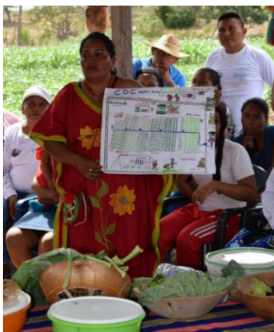
Project for the rapid recovery of food production in the village of Montelara, in