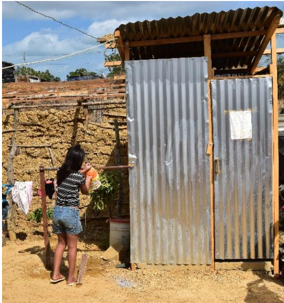
Families in Riohacha, La Guajira, are using the 'tippy tap' built between homes and ZOA, as a new mechanism for hand washing in areas where water is scarce.

During the month of February, more than 41,700 beneficiaries received one or more services in water and sanitation through 23 partners and implementers of the RMRP, in 23 municipalities in 13 departments; assistance was provided mainly in border departments, but also in transit departments. The main actions of the sector include the delivery of sanitation and hygiene kits, as well as key products to more than 20,800 refugees and migrants, considering the differential needs of women, girls, boys, pregnant women, among other profiles. As well, daily access to water and sanitation services was provided to more than 10,300 people at service delivery points (health centers, shelters, canteens, schools, etc.), including 5,500 girls and boys who accessed these services in child development spaces. In addition, more than 4,900 people , including host population, accessed facilities and trainings on safe water and basic sanitation in their communities, and over 1,900 people had access to water and sanitation services at the community and institutional level.