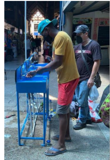
In light of the large concentration of people in the Cenabastos market square in Cúcuta (Norte de Santander), Action Against Hunger installed five portable sinks with access to soap at different points in the square.

The main actions of the sector included the distribution of kits and sanitation and hygiene items for more than 25,000 refugees and migrants, while taking into account the diverse needs of, among others, women, girls, boys, adolescents, pregnant mothers. In addition, over 12,500 people benefitted from daily access to water and sanitation services at service delivery points (health centers, shelters, food distribution points, schools, etc.), including more than 6,600 children and adolescents who accessed these services in learning and child development spaces. Furthermore, more than 11,300 people -including the host community- accessed facilities and participated in training on safe water and basic sanitation in their communities. Additionally, more than 3,500 people received water and sanitation services at the community and institutional level.