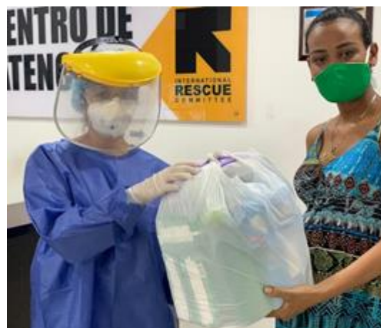
Distribution of maternity kits to the refugee and migrant population, in the Centro Comunitario (CCC) in Cúcuta, Norte de Santander.

*Organizations included in parentheses are implementing partners. Organizations separated by slashes (/) correspond to joint implementation.