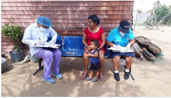
Out-patient health care for the refugee, migrant and host population in La Guajira.

During the month of March, more than 85,600 beneficiaries received one or more services from 31 RMRP direct and implementing partners, in 32 municipalities in 16 departments, in border and transit areas, as well as areas where refugees and migrants have an intention to stay. More than 65,100 primary physical and mental health care consultations and more than 4,000 emergency care consultations were carried out for refugees and migrants, including deliveries and neonatal care. Similarly, more than 8,900 people participated in health information, education and communication activities. In addition, more than 8,100 people received mental health care or psychosocial support. Regarding sexual and reproductive health, more than 3,300 people received prenatal gynecological, comprehensive and medical care. In addition, 47 people were vaccinated according to the national schedule and 15 boys and girls under 5 years of age with acute malnutrition were treated.