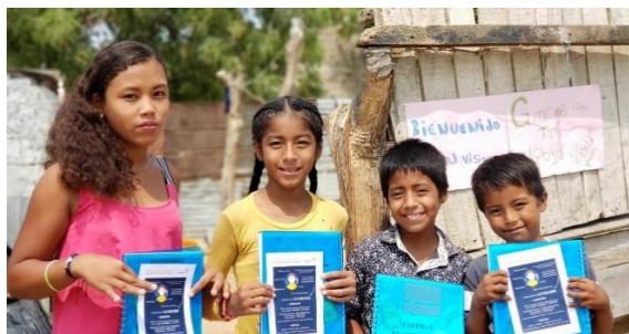
With the support of the Education Cannot Wait fund, study materials were delivered to the homes of children of the Wayúu